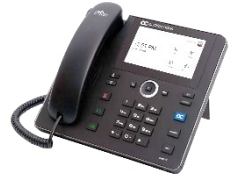
Audiocodes C455 Manager, Executive