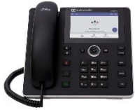
Audiocodes C448 Entry-level