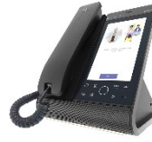
Audiocodes C470 Manager, Executive