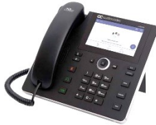
Audiocodes C448HD/C450HD Knowledge Worker