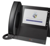
Poly CCX 600 Manager, Executive