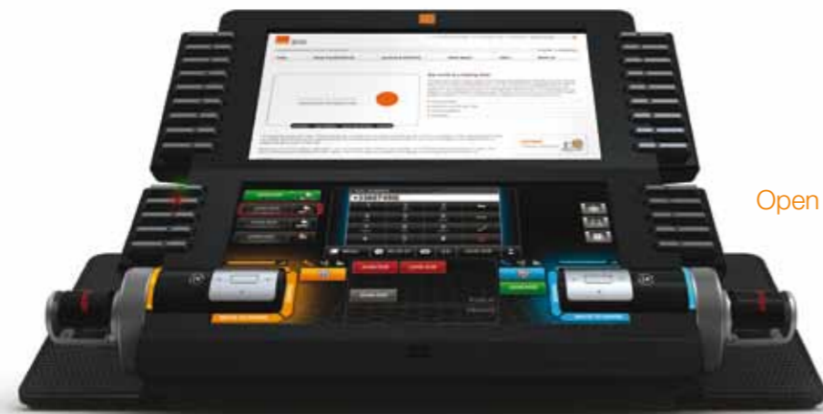
Open Trade Evolution