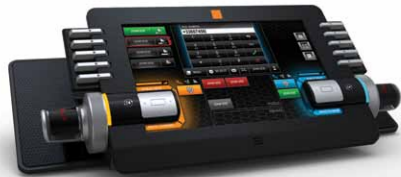
Open Trade Compact

Open Trade is available in two versions to meet your exact communication needs. Open Trade Compact provides a slick, trim single screen option while Open Trade Evolution provides a stylish dual-screen model for advanced trading requirements.