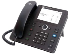
Audiocodes C455HD Manager, Executive