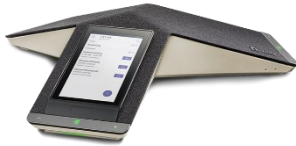
Poly Trio C60 Medium Conference Room