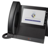
Poly CCX 600 Manager, Executive