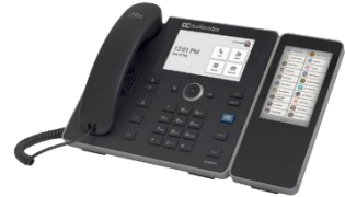
Audiocodes C455HD with Expansion Manager, Executive