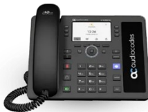
Audiocodes C435 Entry-level Common area

We'll customize your solution around your company identity, your business objectives and your users' preferences. You won't just have Microsoft Teams; you'll have your personal Microsoft Teams.