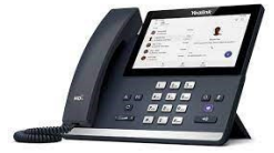
Yealink MP56 Office, Knowledge Worker