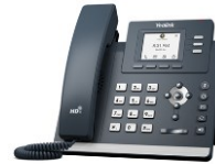
Yealink MP52 Entry-Level Phone