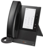
Poly CCX 400 Entry-Level Phone