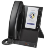
Poly CCX 500 Office, Knowledge Worker