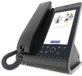
Audiocodes C470HD Manager, Executive